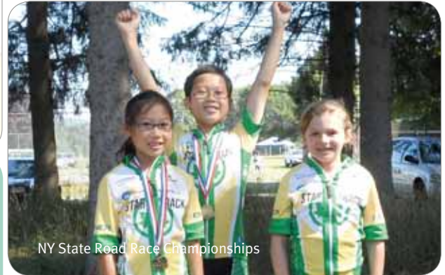
NY State Road Race Championships

Mail to: Star Track c/o Bike New York 475 Riverside Drive - 13th Floor New York, NY 10115