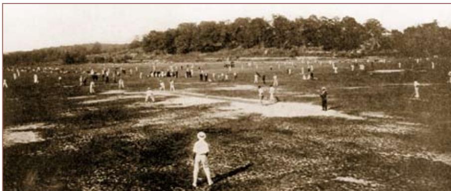
Cricket on the Parade Ground, circa 1914