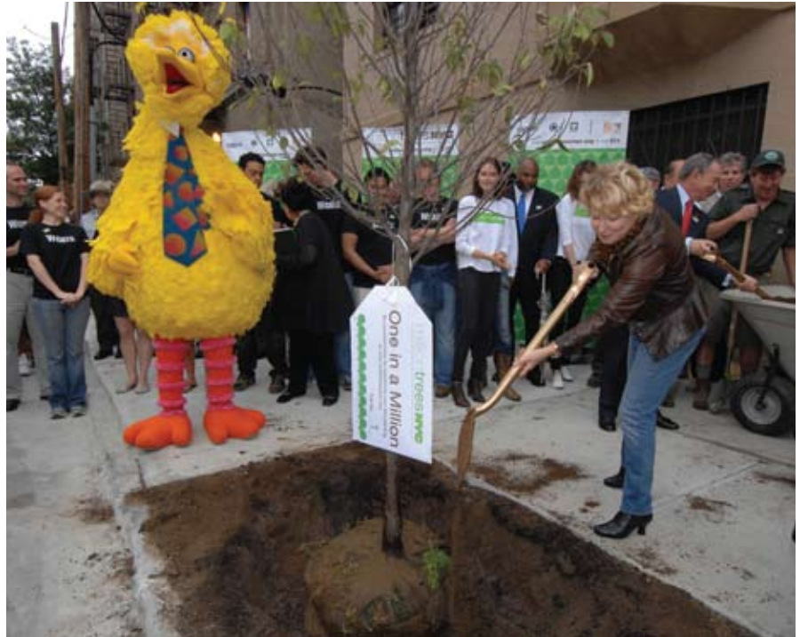
Big Bird joined the festivities in the Bronx as Bette Midler and Mayor Bloomberg plant Tree #1 to kick off Million Trees NYC .