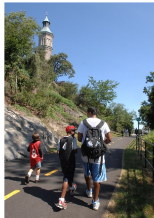
Photo: High Bridge Access Path, Highbridge Park, MN