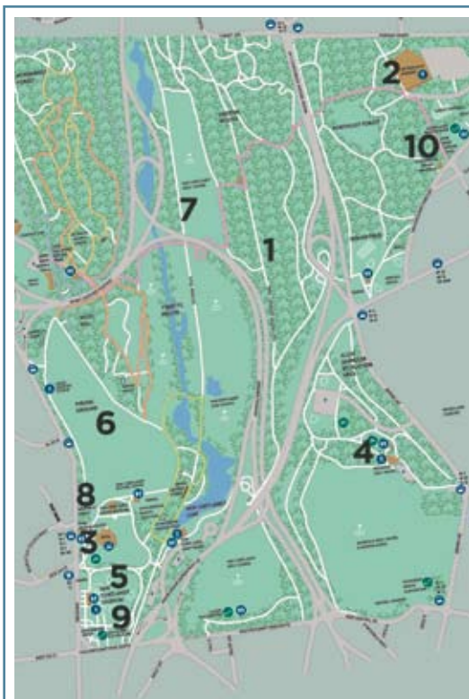
Numbers on this thumbnail map correspond with project descriptions.

2. Bronx Greenhouse and Nursery renovations and expansion will include upgrades to the 'cold frames,' greenhouses, loading docks, irrigation lines, sewer lines and access ways at a cost of $2.7 million.