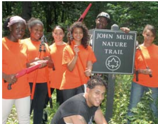
Teens in their internship groups: Top Row: Van Cortlandt Golf Course, Mosholu Golf Course, Riverdale Equestrian Center Bottom Row: Friends of Van Cortlandt Park, Lehman College GEAR UP